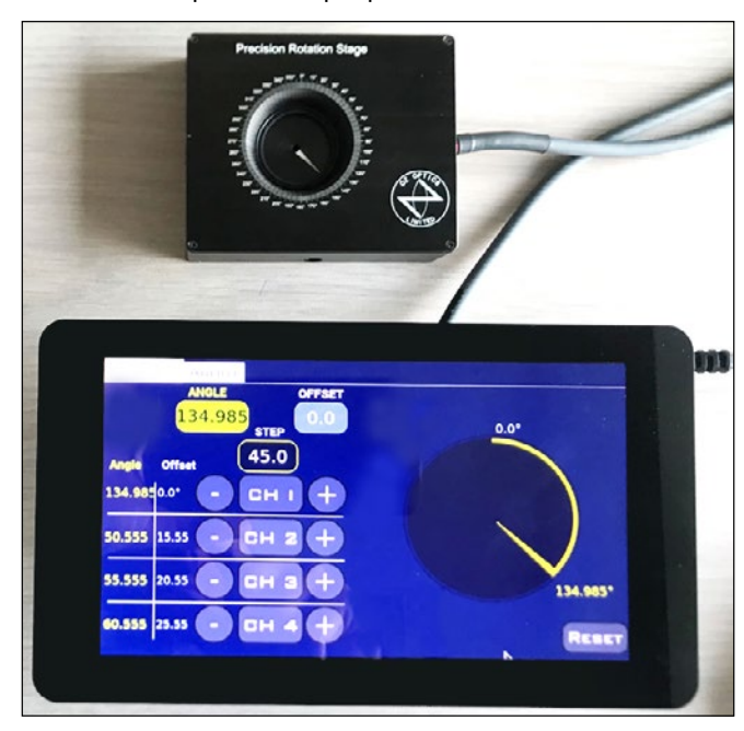
Fig:2. A single rotation stage along with a control unit and built-in touch-screen is powered up using 5V DC power supply.

The input and output ports of a given stage can be fiber-connector receptacles, pinholes for free-space applications, or pigtailed with single mode, polarization maintaining or multimode fibers. The light beam is then directed through one or more rotators, where the polarization state (the electric field of the propagating wave) is manipulated via rotating waveplates, polarizer plates, polarizer prisms or polarization beam splitters with sub-degree resolution.