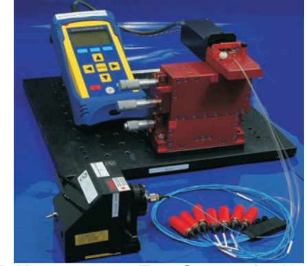
ER-Measurement Test System for V-Groove (Manual Type)

MAN : = Add to part number for manual type V-Groove measurement system