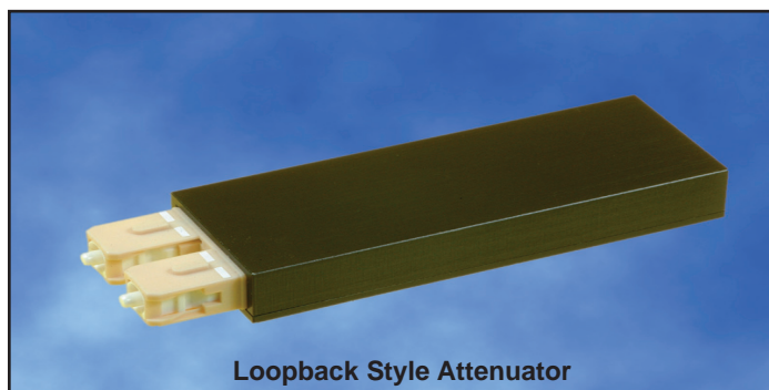
Loopback Style Attenuator