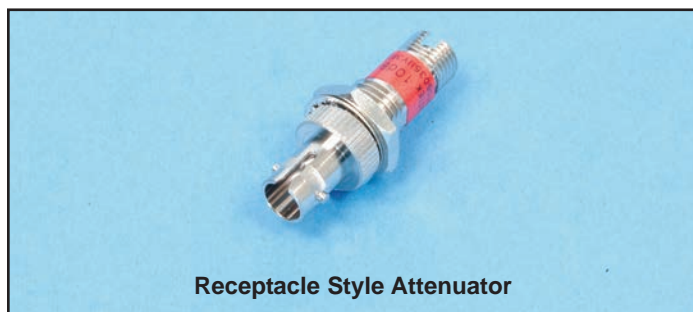
Receptacle Style Attenuator