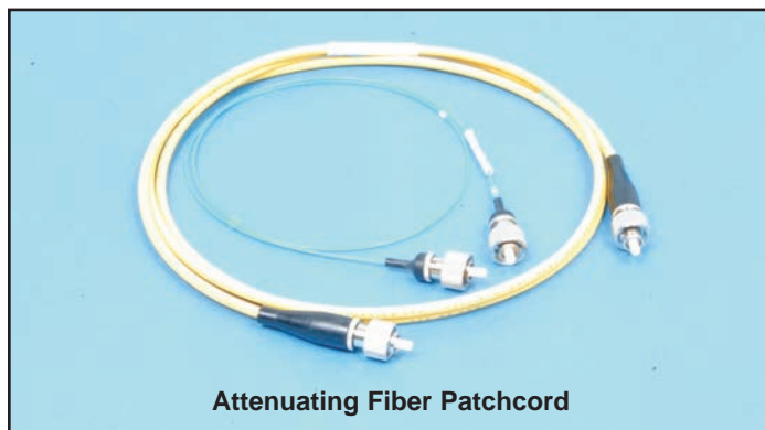
Attenuating Fiber Patchcord