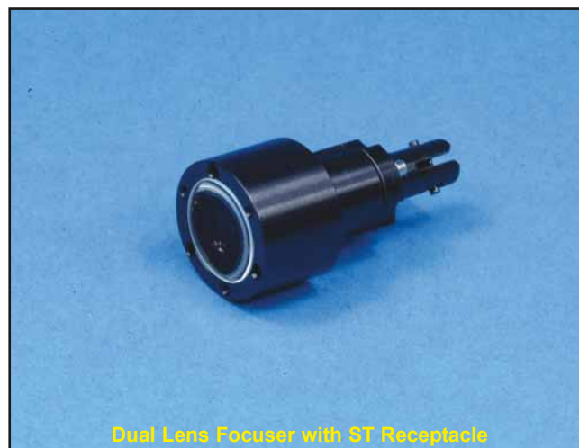
Dual Lens Focuser with ST Receptacle