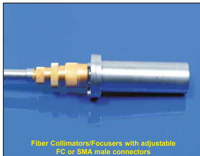
Fiber Collimators/Focusers with adjustable FC or SMA male connectors