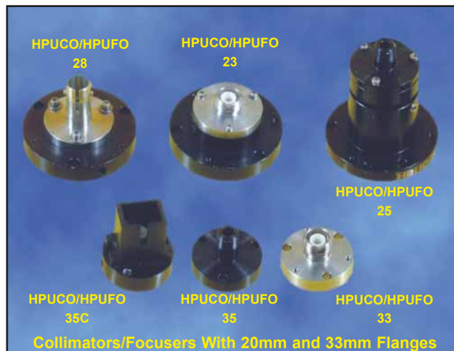
Collimators/Focusers With 20mm and 33mm Flanges

OZ Optics standard tables list the definitions used for each fiber type, as well as conversion factors to convert values to 1/e^2 values. OZ Optics uses 1/e^2 definitions for its calculations of the beam diameter wherever possible.