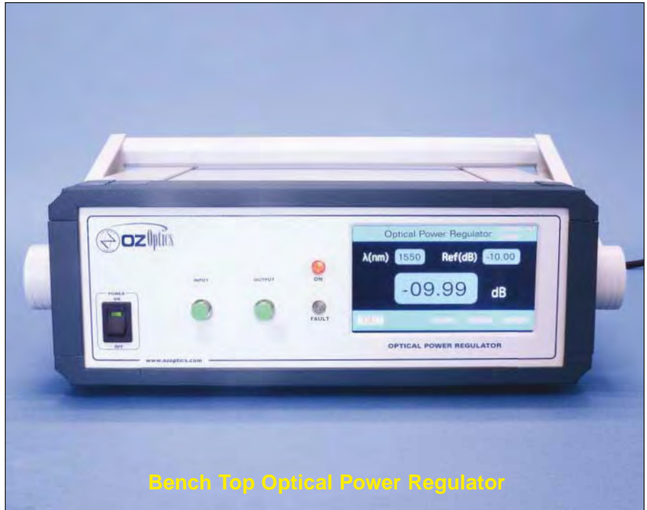
Bench Top Optical Power Regulator

Optical power regulators are used wherever one has an unstable output from an optical fiber and one needs a more stable signal. They are ideal for power stabilization in DWDM networks, where changes in power can produce transmission errors. The complete unit is available either as a miniature module that can be integrated into other devices, a stand-alone module for testing, or as a rack mountable unit for optical networks. Contact OZ Optics for further information.