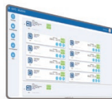
Multi-User Interface EXFO Multilink