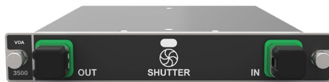
With or without the power monitoring option, the FTBx-3500 module occupies just a single slot.

Network equipment manufacturers and transceiver manufacturers know that variable attenuators are essential components of their test systems. They look for performance, user-friendliness, complete control of test parameters and advanced programming capability. EXFO's FTBx-3500 variable attenuator combines innovative design techniques, high-quality components and meticulous calibration procedure.