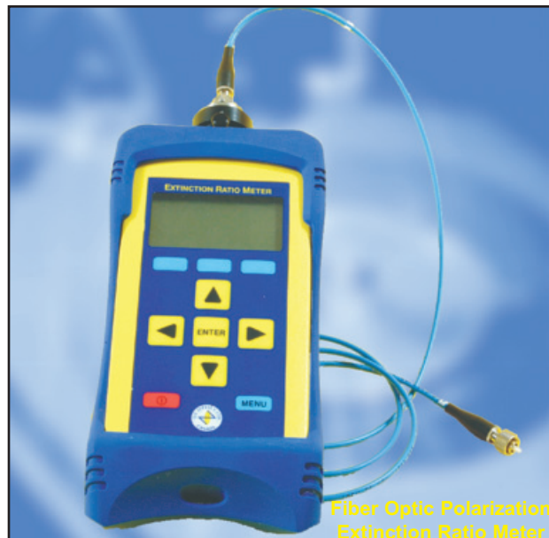
Fiber Optic Polarization Extinction Ratio Meter