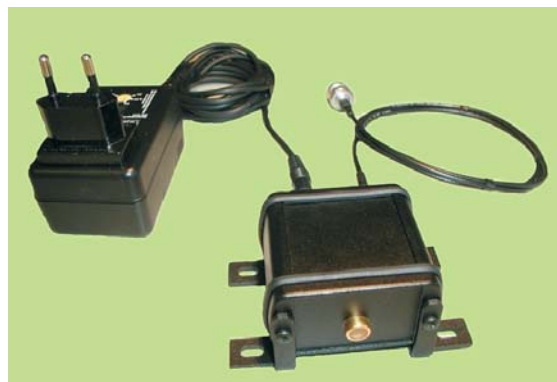
Fig. 1: Photomicrograph of the id Quantique's id100-20.

For parallel measurements , id Quantique has introduced the id150. This 1x10 linear array of single photon detectors is the first commercially available product allowing high throughput parallel photon counting and timing measurements ( http://www.idquantique.com/spcm-vis-10.html ). For further information on our products, please contact id Quantique by phone: +41 (0)22 301 83 71, fax: +41 (0)22 301 83 79, or email: sales@idquantique.com . Note that id Quantique also offers photon counting modules operating in the infrared and short-pulse laser sources. Custom developments of single photon sensors including arrays are possible.