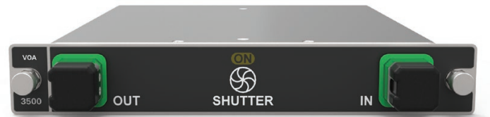
With or without the power monitoring option, the FTBx-3500 module occupies just a single slot.

Featuring integrated power monitoring, the FTBx-3500-BI allows you to precisely control the amount of power your receiver (Rx) under test detects, thereby enabling you to achieve proper BER measurements. The FTBx-3500-CI or FTBx-3500-DI enable similar characterization for multimode applications.