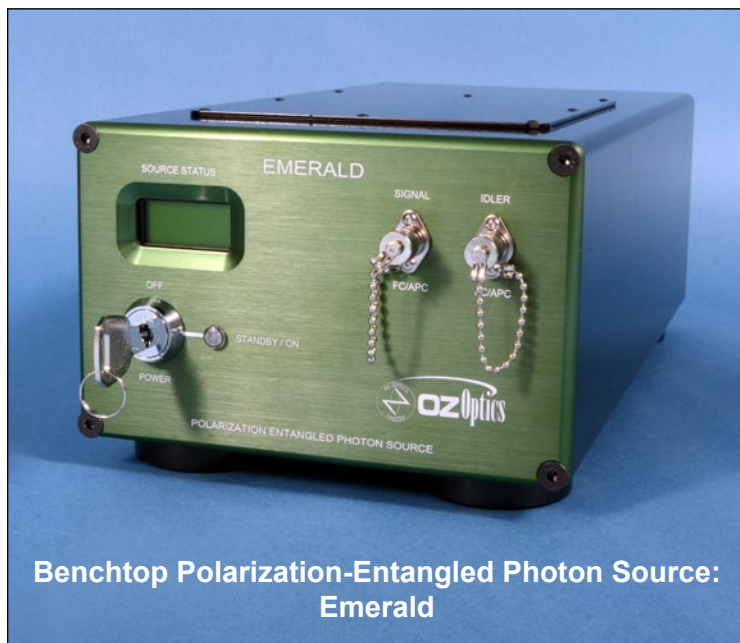
Benchtop Polarization-Entangled Photon Source: Emerald