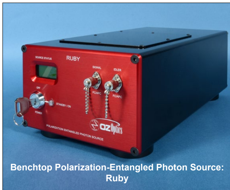
Benchtop Polarization-Entangled Photon Source: Ruby

Ruby entangled photon sources make use of Type 0 down-conversion to generate a broadband biphoton spectrum, with a bandwidth of several tens of nanometers. Emerald entangled photon sources make use of Type 2 down-conversion to generate a narrow bandwidth biphoton spectrum, with a bandwidth of a few nanometers. In both cases the interferometer engine ensures photon entanglement regardless of the down-conversion type. OZ Optics can assist in selecting the preferred version (Ruby or Emerald) depending on your target wavelength and application.