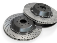
Manufacturing process control