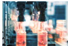
Glass manufacturing quality assurance