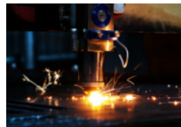
Laser Process Monitoring