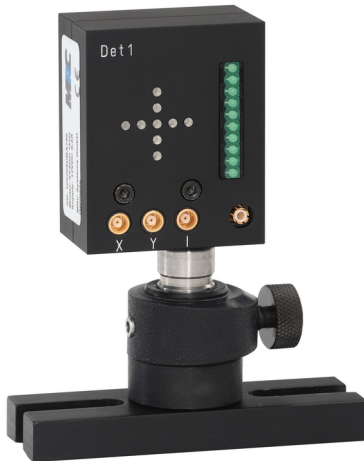
Figure 1: Rear view of PSD detector (The base plate is not included in the delivery.)