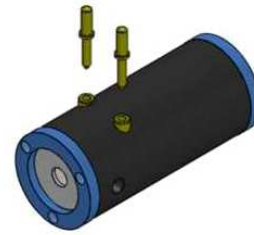
Chiron 3 BBO Pockels Cell