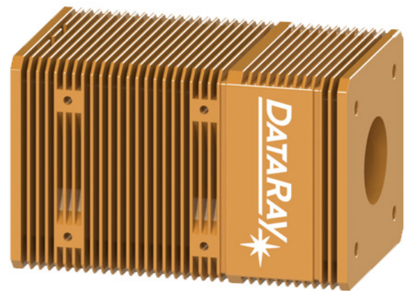
WinCamD-QD-1550 66 x 66 x 99 mm