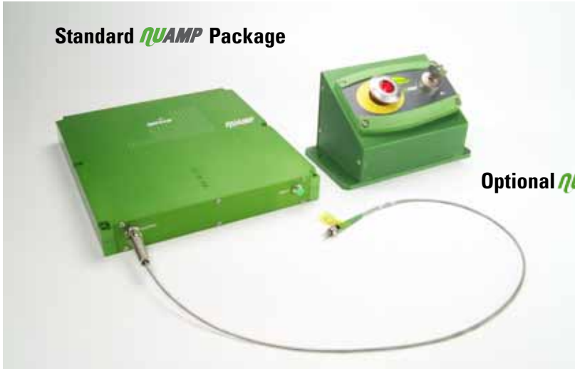
Standard nuAMP Package