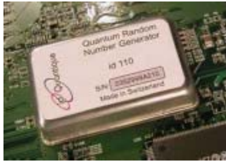
Figure 3: The Quantis random number generator.